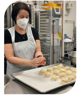
PRE-EMPLOYMENT PROGRAM OUTCOMES January – June 2023

With over 85% of our participants relying on social assistance for their income, our pre-employment programs are designed to help people prepare to re-enter the workforce and become self-sufficient. Our programs consistently achieve success rates well above industry standards. We define success as attaining employment, enrollment in further training/education, enrollment in a specialized treatment program, and/or active volunteering.